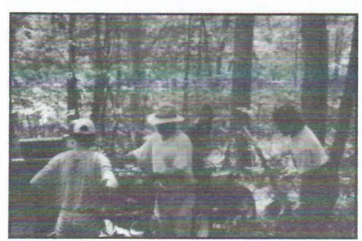
Work goes on at Allatoona Pass.

constructed by the end of May, 1996. The Corps of Engineers has already expanded the parking lot at the south end of the Pass to accommodate the many visitors