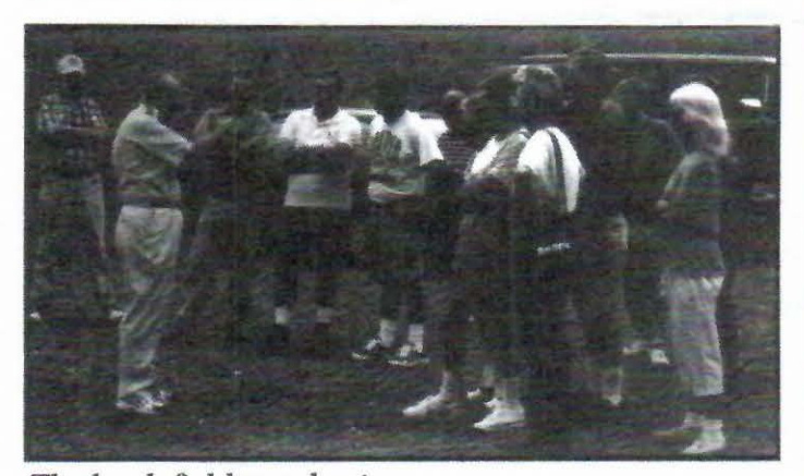
The battlefield tour begins.

Your copy of Allatoona Pass, A Needless Effusion of Blood, can be obtained from the EVHS office for $16 (softcover) or $28 (leather).