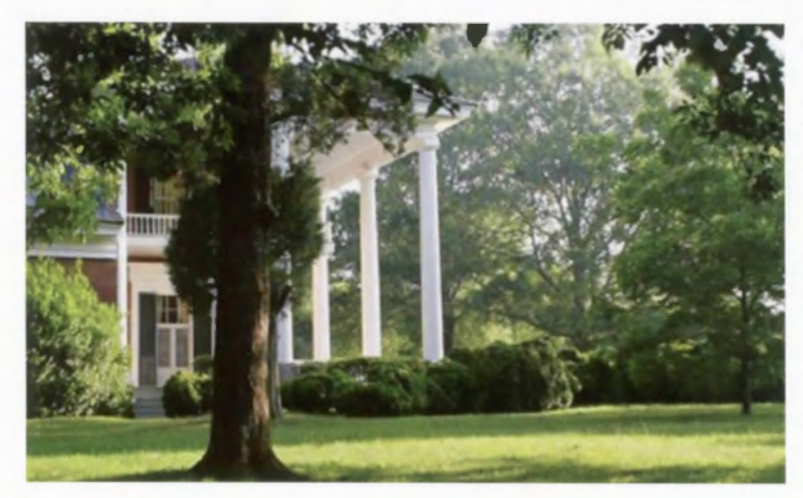
Valley View (circa 1840)