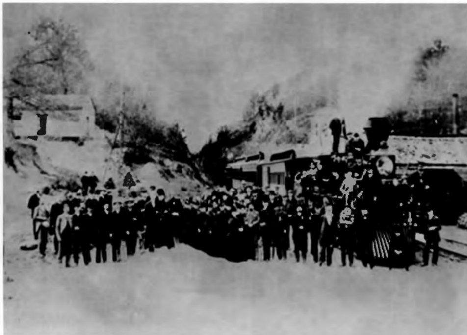
General Corse (of Battle of Allatoona Pass fame) returns to Pass in 1886. See next image for description.