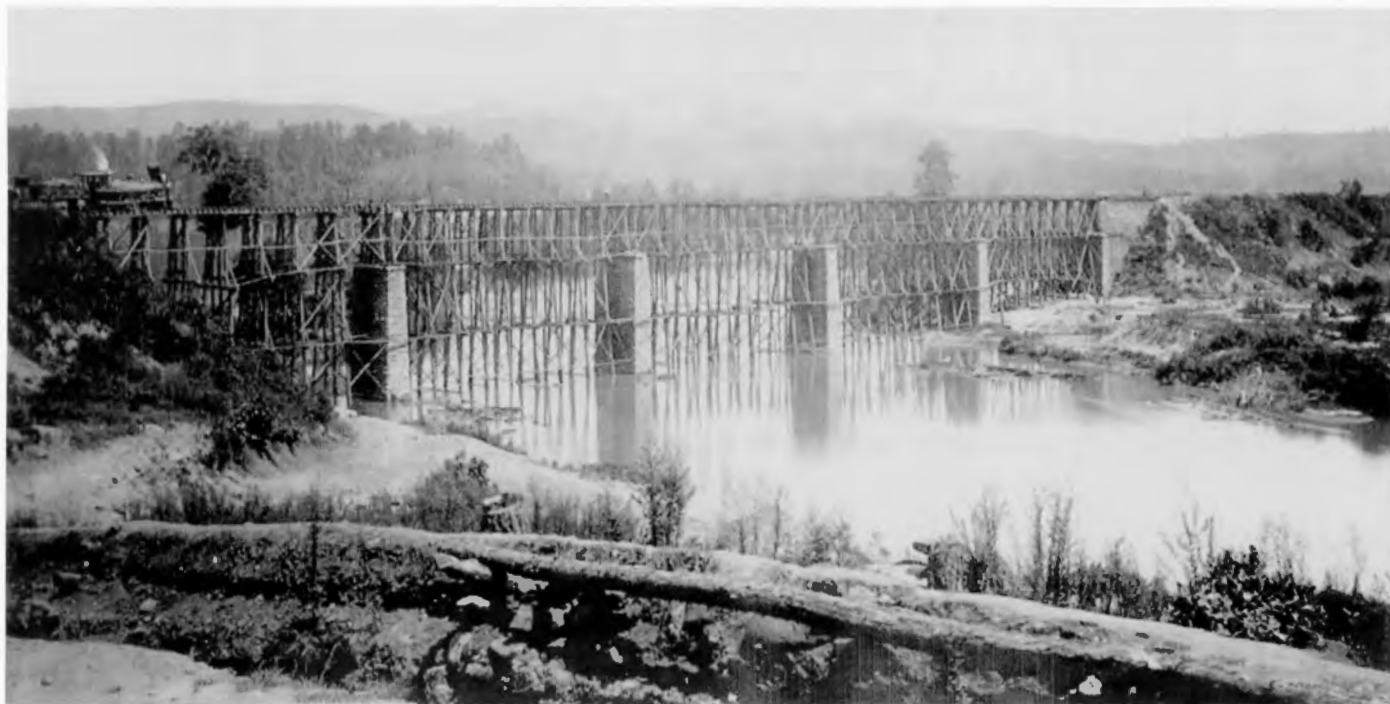
Etowah River Bridge, Circa 1865