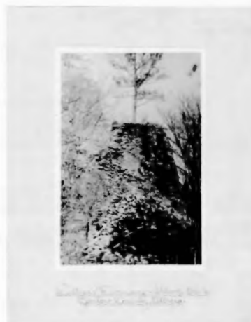
Stamp Creek

Puzzled about how some Bartow Communities got their name? This is old furnace at Stamp Creek, taken in 1949.