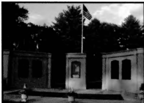
The Kingston Woman's History Club opened its museums for a Look at Kingston' Past.