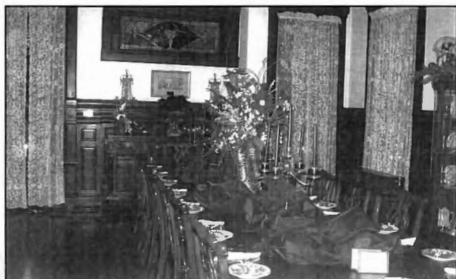
Rose Lawn was beautifully decorated for the EVHS Christmas Party