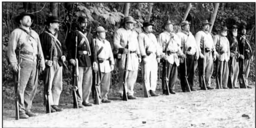
Civil War Re-enactors Line Up At The 161st Anniversary Observation Of The Battle of Allatoona Pass

The battlefield has well-marked trails with interpretive signs and is open to the public.