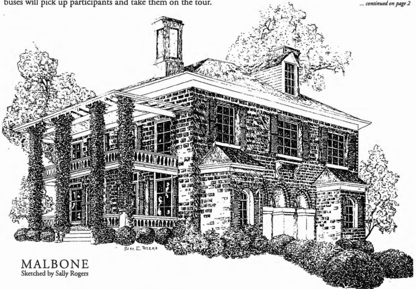
MALBONE Sketched by Sally Rogers