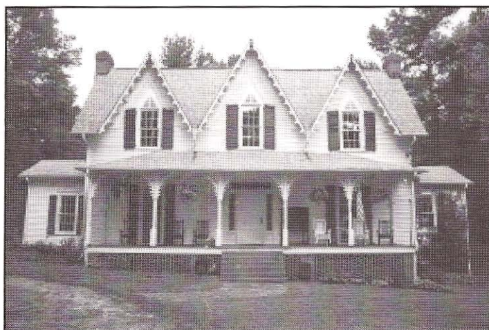
The Munford-Birdsong House in Powder Springs

Before the Munford house was moved, it was last oc-