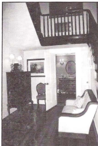
The grand foyer