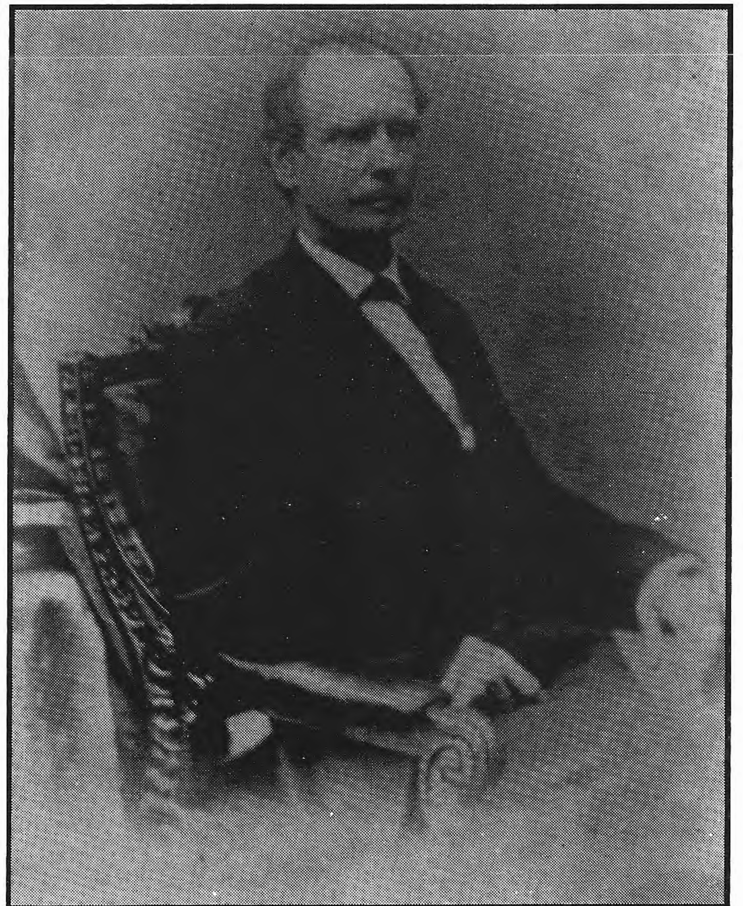
Amos Tappen Akerman, Attorney General of the United States July 8, 1870-January 10, 1872.

Amos began his education in the local school in Portsmouth before transferring to Phillip's Exeter Academy in 1836. Amos